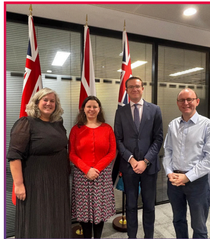
Tim meets Transport Secretary with neighbouring Labour MPs.

This decision protects valuable farmland, safeguards our environment, and shows that when communities come together with determination, their voices are heard.